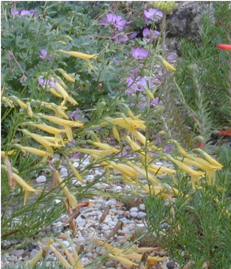
Penstemon pinifolius "Mersea Yellow"

( Note--My rock garden consists of 1-2' of torpedo sand (also known as builders sand) dumped on the lawn. Ed Glover reported some years ago about great success with this